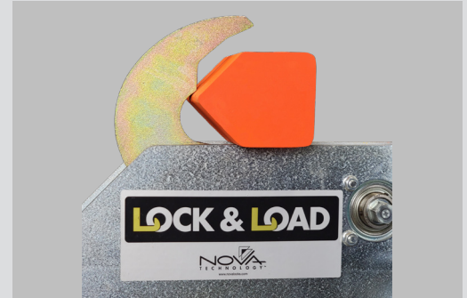
Designed to secure pentagonal RIG bars