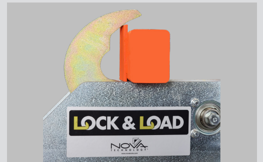
Engages reinforced RIG bars with 4 1/2-inch vertical center plates